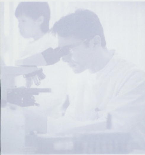
NIH Research Money Budgeted per Death